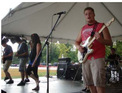
Turn It Up – The band Midnight Vespers entertains students and friends at the Acres Shakers earlier this fall. The band is comprised of Alpha Delta brothers.